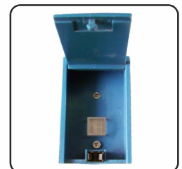
1 Photometric Channel