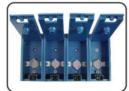
4 Coagulation Channels